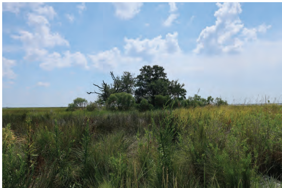
FIGURE 4. Typical earthen mound site in the marsh.

Environmental and anthropogenic-driven impacts to all of these sites are expected to increase in intensity. The crisis on the coast is by no means a passive or long-term process for many archaeological sites. Impacts have been ongoing for decades, and the resulting loss will inevitably be a near-total loss for the state of Louisiana and the broader cultural heritage of the United States. The current analysis, consultation with community partners and organizations, the development of a robust partnership consortium, and data recovery and prioritized mitigation strategies