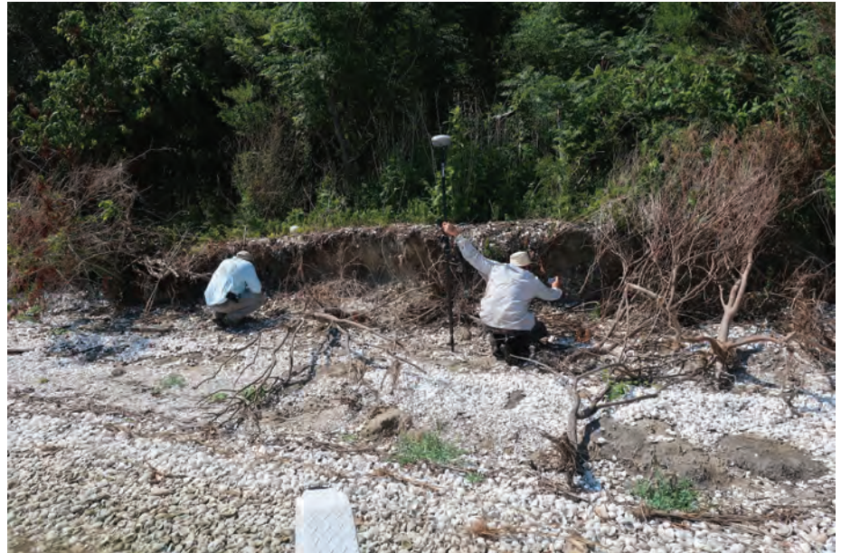
FIGURE 5. Inspecting an eroded shell midden.

will continue to underscore the mission of the MRDAM project. By better understanding the environmental processes and engineered effects that are rapidly eroding these archaeological sites, we can implement action-based mitigation strategies, thereby improving understanding of the collective cultural heritage of the Gulf Coast of Louisiana and preserving and protecting this endangered scientific information for future generations.