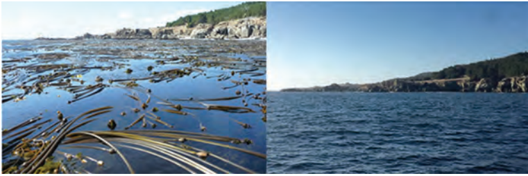
FIGURE 2. Comparison of healthy (2012; left) and degraded (2016; right) kelp canopy at Ocean Cove within Greater Farallones National Marine Sanctuary.