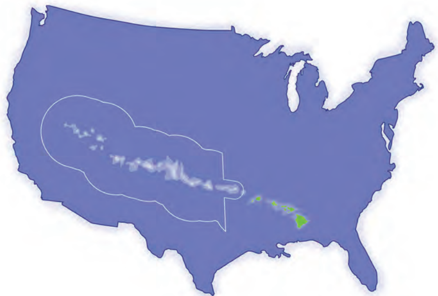
FIGURE 5. Overlay of Papahānaumokuākea Marine National Monument (outlined in white) on top of the continental United States. Graphic by Papahānaumokuākea Marine National Monument.

As climate impacts have become more widely understood over the past decade, government agencies and nongovernmental organizations have been working to develop and deliver training materials focused on climate adaptation strategies for resource managers. Here too, the understanding of the science and tools available to marine managers, and focused training efforts, have lagged behind terrestrial counterparts. However, in 2018 the USFWS National Conservation Training Center (NCTC) began a partnership with NOAA to adapt a core course on climate adaptation—“Planning for a Changing Climate”—into a version with a coast-