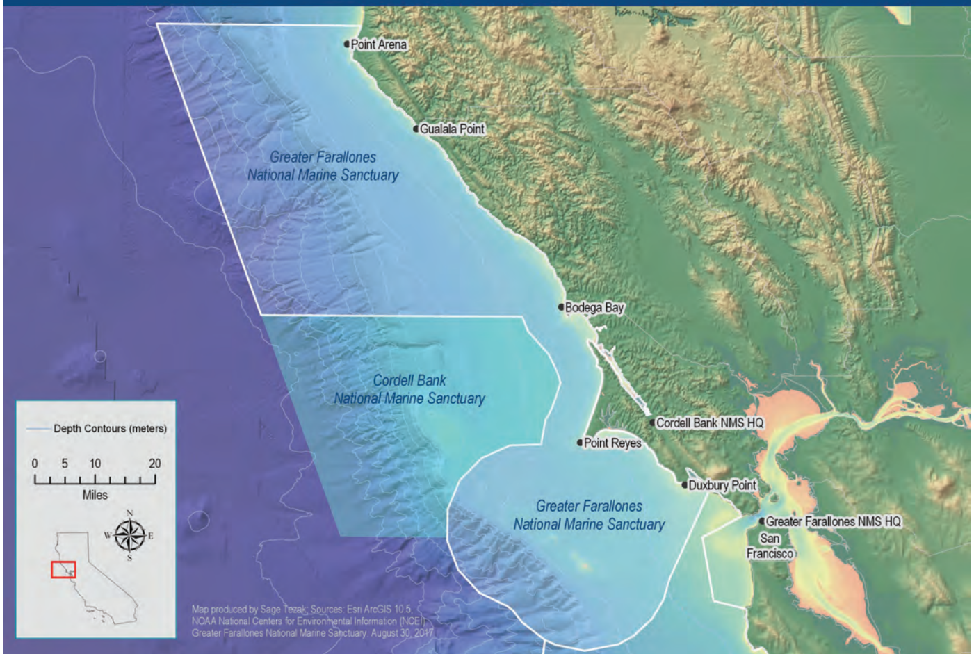
FIGURE 1. Greater Farallones National Marine Sanctuary. Map by NOAA ONMS.

California and GFNMS. Further, like trees in terrestrial forests, kelp may play a role in climate mitigation. There is some evidence that kelp are globally significant to carbon sequestration (Krause-Jensen and Duarte 2016). Kelp may even locally alleviate ocean acidification (Nielson et al. 2018). Thus, the assessment of moderate-to-low vulnerability for this important habitat was encouraging.