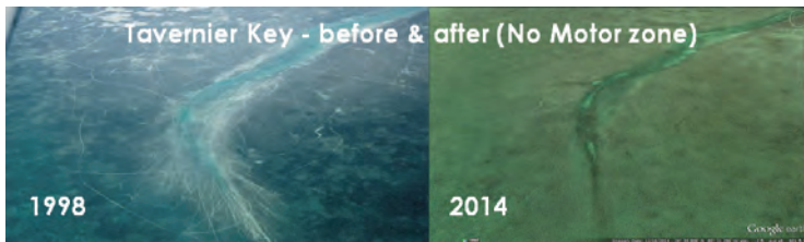
Figure 4. Aerial views near Tavernier Creek within Florida Keys National Marine Sanctuary taken in 1996 and 2014 show significant shallow-water habitat recovery due to the 1997 designation of a wildlife management area.

for successful climate adaptation. A prime example is Papahānaumokuākea Marine National Monument, the largest protected area in the US. This expansive MPA encompasses the islands and waters of the northwestern Hawaiian Islands (Figure 5). Covering 582,578 mi 2 and stretching for a distance of 1,350 mi, it encompasses an area larger than all the nation’s national parks combined. Papahānaumokuākea is comanaged by four trustees: NOAA, US Fish and Wildlife Service (USFWS), the state of Hawaii, and the Office of Hawaiian Affairs. This partnership has allowed the managers of Papahānaumokuākea to pull from a breadth of expertise and resources in order to successfully navigate the daunting task of managing one of the largest, most remote MPAs on Earth under a changing climate. For example, a 2019 research cruise in Papahānaumokuākea documented widespread coral damage at French Frigate Shoals, an atoll in the monument, from Hurricane Walaka, a Category 3 storm that passed through the area in October 2018. That year was the most intense Pacific hurricane season on record, part of a pattern of more intense storms due to warmer oceans. The ability for Papahānaumokuākea managers to leverage a range of expertise and resources allows for the flexibility needed to adapt to this and other climate stressors now and in the future.