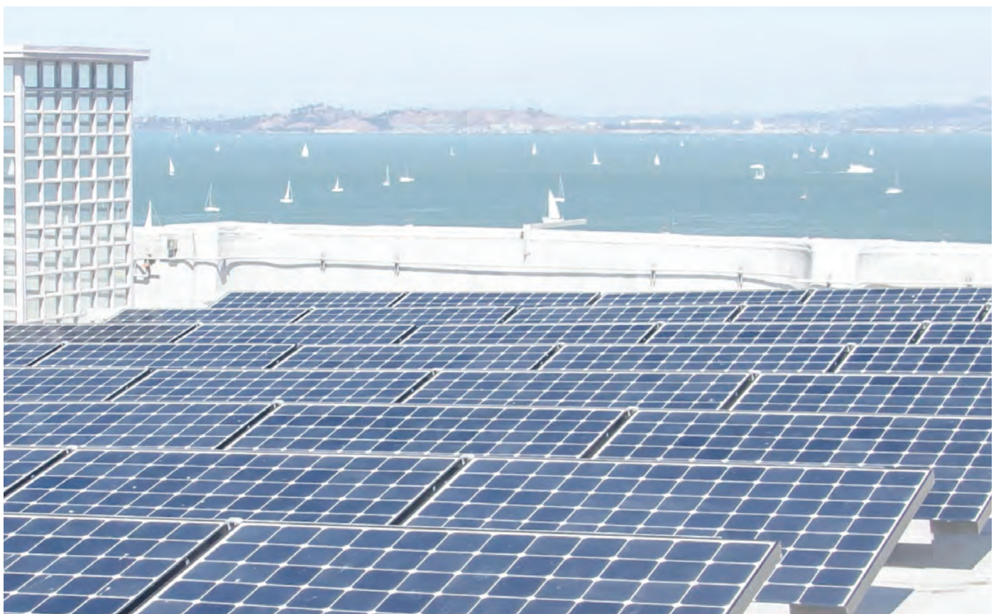
FIGURE 6. Solar energy array on Alcatraz Island in Golden Gate NRA that helped the park reduce carbon emissions 25% from 2010 to 2015 (NPS 2016).

Reducing CO 2 emissions can avert the most extreme temperature increases in national parks in the future. The IPCC emissions reduction scenario (RCP2.6), in which the world would meet the Paris Agreement goal, would lower projected heating in national parks by two-thirds by 2100, compared with the highest emissions scenario (RCP8.5) (Gonzalez et al. 2018). The reduced heating could produce substantial benefits on the ground. While the highest emissions scenario puts 16% of plant and animal species globally at risk of extinction, the risk drops to 5% under the emissions reduction scenario (Urban 2015). Similarly, global sea level could rise 84 cm (33 in.) under the highest