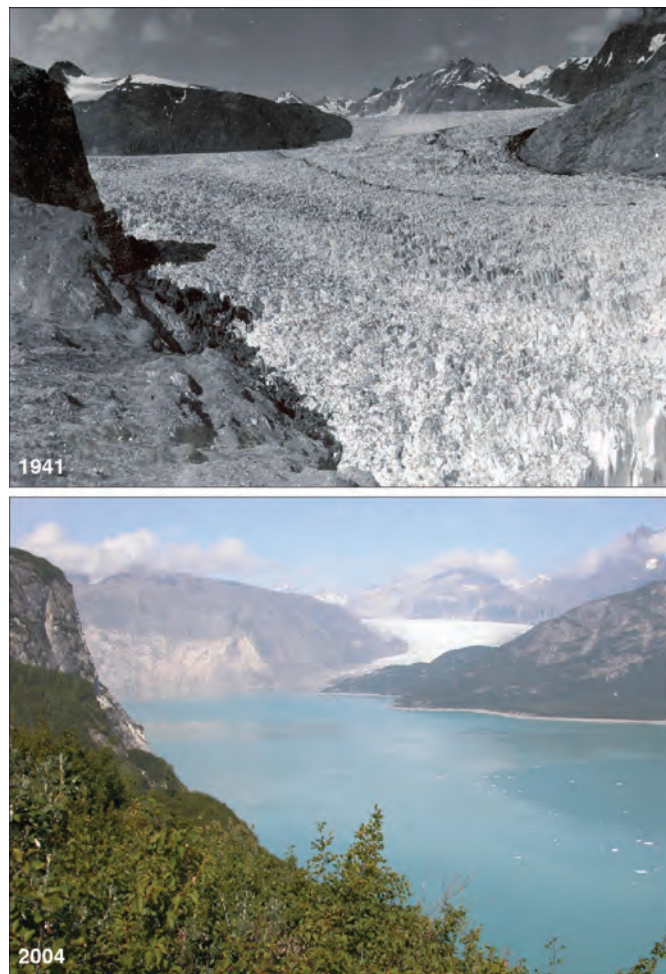
FIGURE 2. Muir Glacier, Glacier Bay NP on August 13, 1941 (photo William O. Field, courtesy of the National Park Service, National Snow and Ice Data Center, and US Geological Survey) and on August 31, 2004 (photo Bruce F. Molina, courtesy US Geological Survey). Photos aligned by P. Gonzalez. From 1948 to 2000, climate change melted 640 m in depth from Muir Glacier at its lowest extent (Larsen et al. 2007; Marzeion et al. 2014).

Across the southwestern US, the increased heat and aridity of human-caused climate change account for half the magnitude of a regional drought from 2000 to the present that has been the most severe drought since the 1500s, reducing soil moisture to its lowest levels since that time (Williams et al. 2020). In California, the most severe drought in a century of weather station measurements occurred from 2012 to 2016, caused by the hottest annual average temperature in the period 1896–2014 and near-record low rainfall and snowfall (Diffenbaugh et al. 2015). The high temperatures of climate change accounted for one-tenth to one-fifth of the magnitude of the California drought (Williams et al. 2015). In the Colorado River Basin, the high temperatures of climate change have combined with low rainfall and snowfall to cause a drought from 2000 to the present that is the most severe since the start of weather station measurements in 1906 (Udall and Overpeck 2017; Xiao et al. 2018).