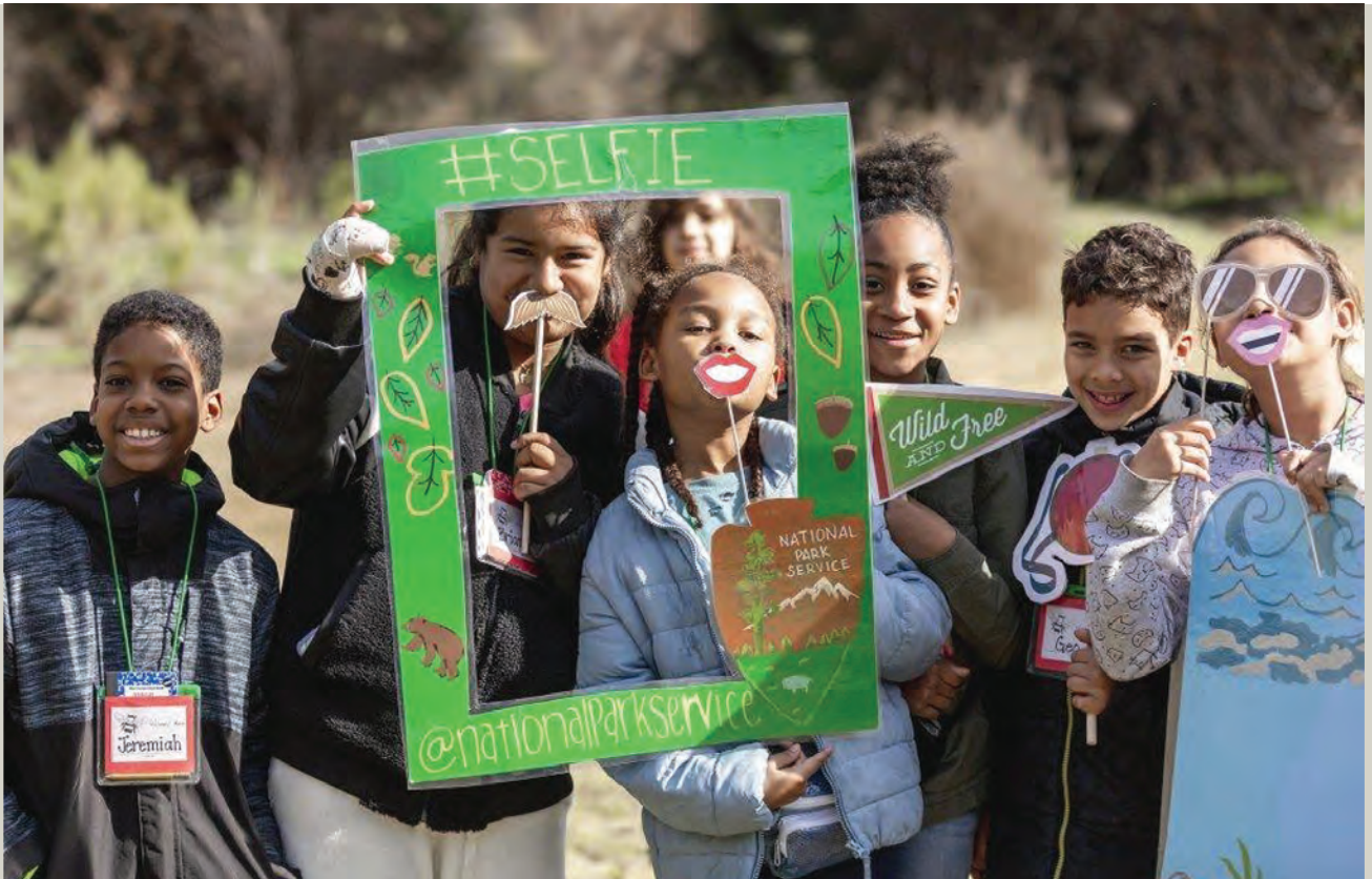
Open OutDoors for Kids participants enjoying their field trip to Santa Monica Mountains National Recreation Area.