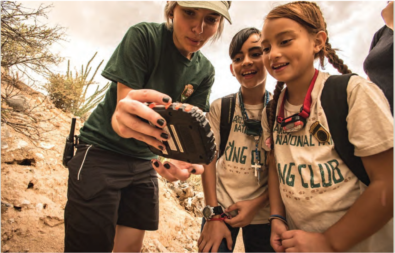
Field trip participants to Saguaro National Park.