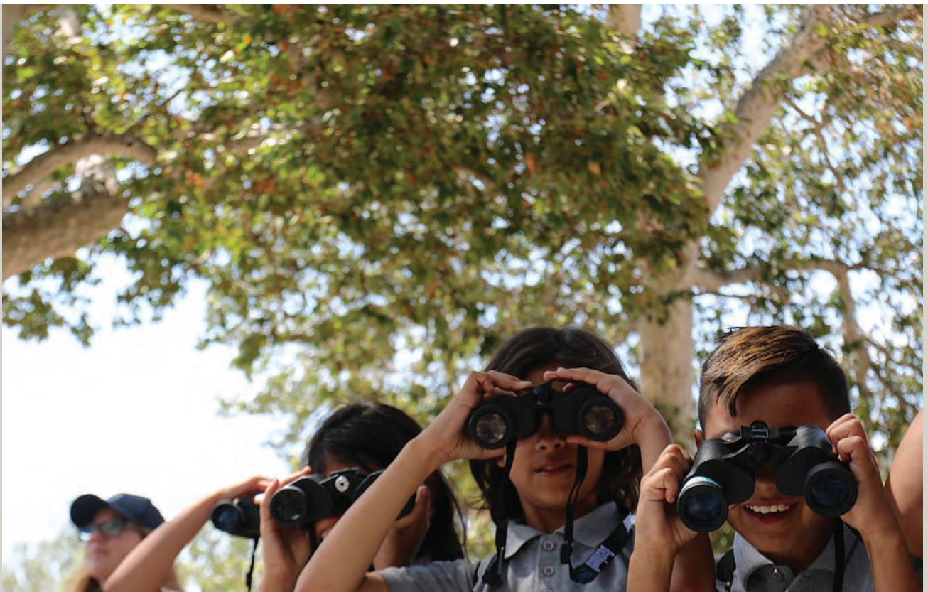
Open OutDoors for Kids participants utilizing binoculars for scientific observation, Santa Monica Mountains National Recreation Area.