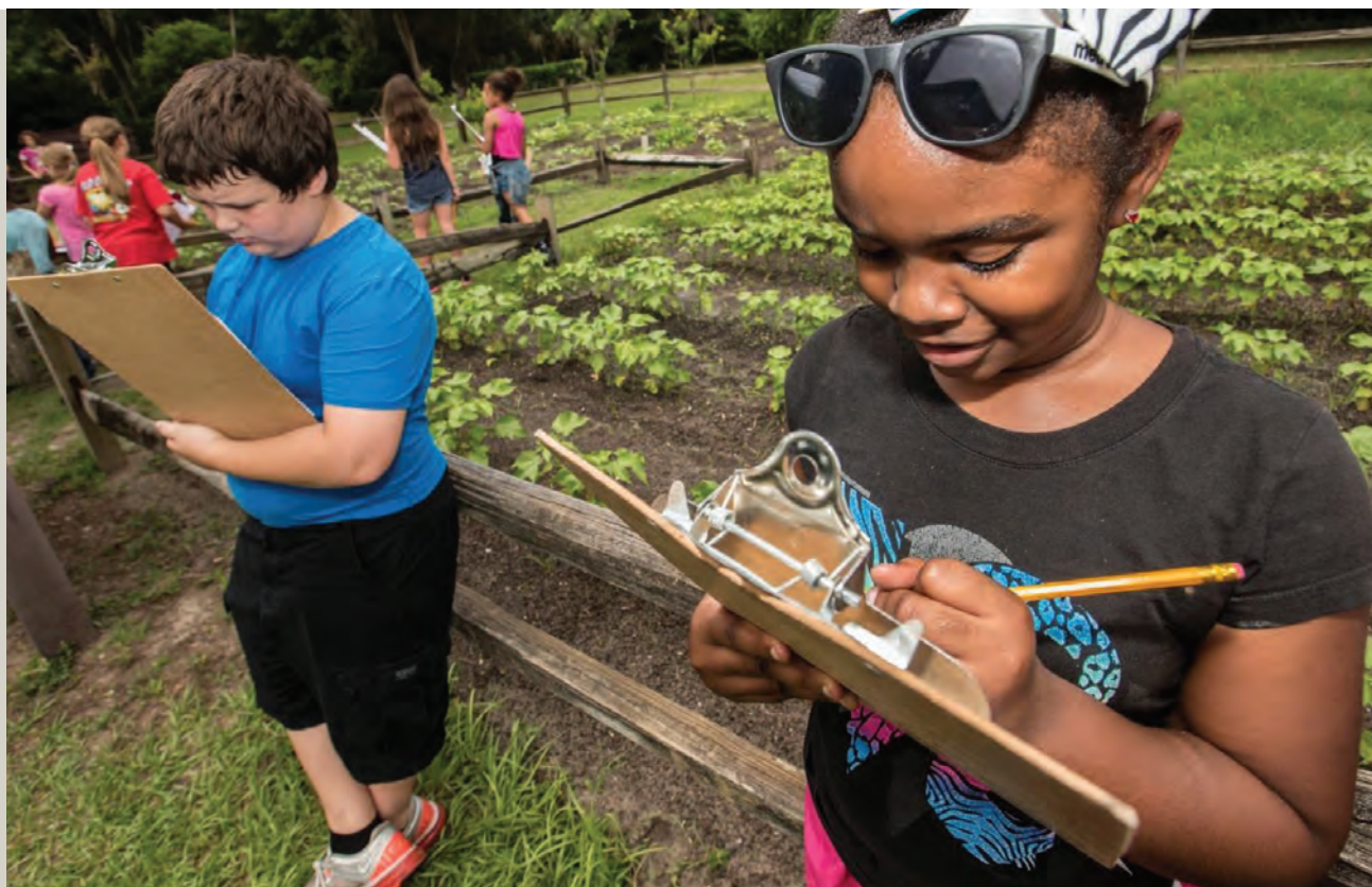
Students note their observations in the field at Kingsley Plantation, Timucuan Ecological and Historic Preserve (USNPS), near Jacksonville, Florida.

percent said they definitely would come back and another 19% said they probably would come back (Applied Research Northwest 2019b). Though the program's evaluation reports query only intention to return, research studies on increasing inclusion on public lands suggest factors that contribute to these responses. These include the fact that (a) students can envision themselves in parks, (b) activities are carefully planned to be accessible and provide students with skills and knowledge necessary to accomplish them, and (c) park staff are welcoming and inclusive (Markle et al. 2019). A teacher participant who participated in an Indiana Dunes National Lakeshore [now National Park] field trip supported these points saying, "The park did great on building relationships with kids and helping kids build an understanding, and even a love for, nature" (Applied Research Northwest 2019b: 26).