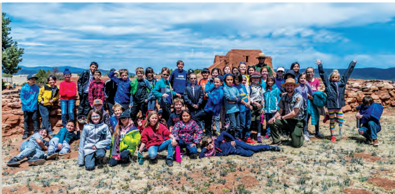
School kids celebrating a field trip to Pecos National Historical Park.

and learned about the history of the site as they participated in educational activities with rangers and volunteers. More than 100 students were able to participate in this program.