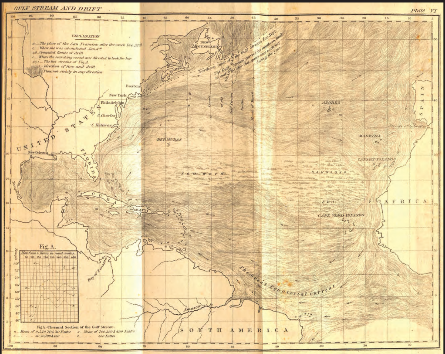
Gulf Stream chart from Maury's The Physical Geography of the Sea .