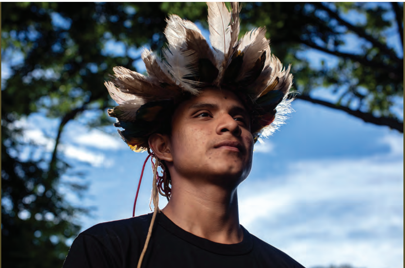
Brazilian ranger

Adequate numbers of competent, well-resourced, and well-led rangers are the foundation for effective management of most protected and conserved areas. The International Ranger Federation (IRF) defines “ranger” as a person involved in the practical protection and preservation of all aspects of wild areas, historic