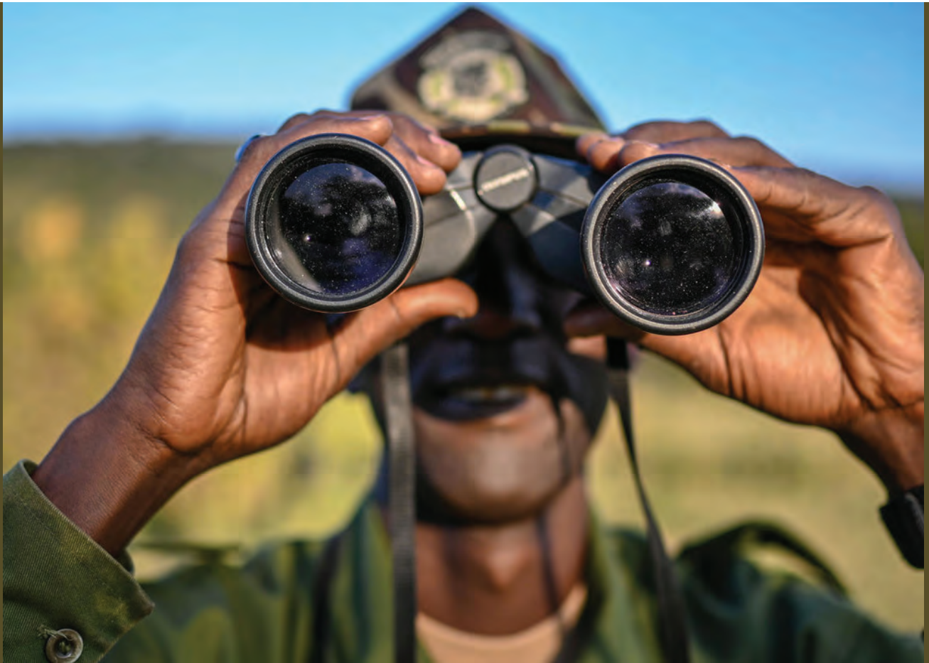
Kenyan ranger

Indigenous people and local communities and rangers are built, safeguarding all parties, and increasing collaboration, dialogue, and transparency.