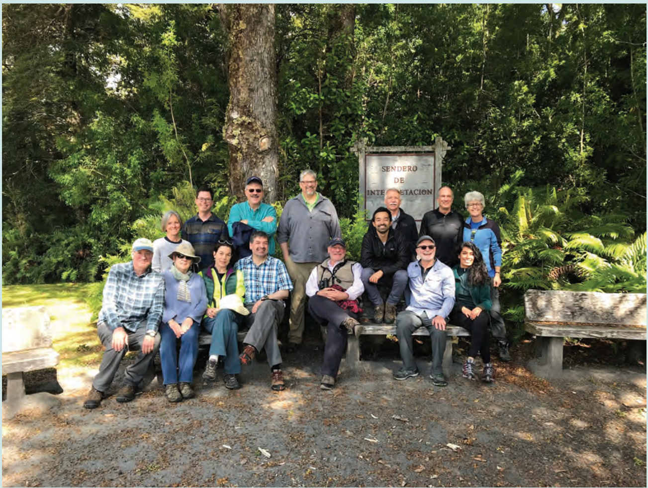
Figure 1. Participants gather in Parque Pumalín, Chile, during the 2018–2019 Large Landscape Peer Learning Exchange.

strategic visions. The final field visit ended with the expert workshop, during which the teams were joined by external experts from the landscape stewardship and conservation community who provided feedback and constructive input into strategies for achieving the teams' visions. After the conclusion of the field visits, the Lincoln Institute team provided support for continued advice and implementation of key strategic actions that would advance landscape conservation outcomes identified by the teams.