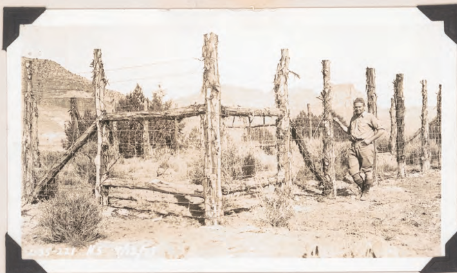
George M. Wright

Research Area No. .... Subject Scenery - Range study plot, elevation 4,500, forage type sagebrush & black brush No neg. in file. Date April 12, 1935 Locality Petrified Forest