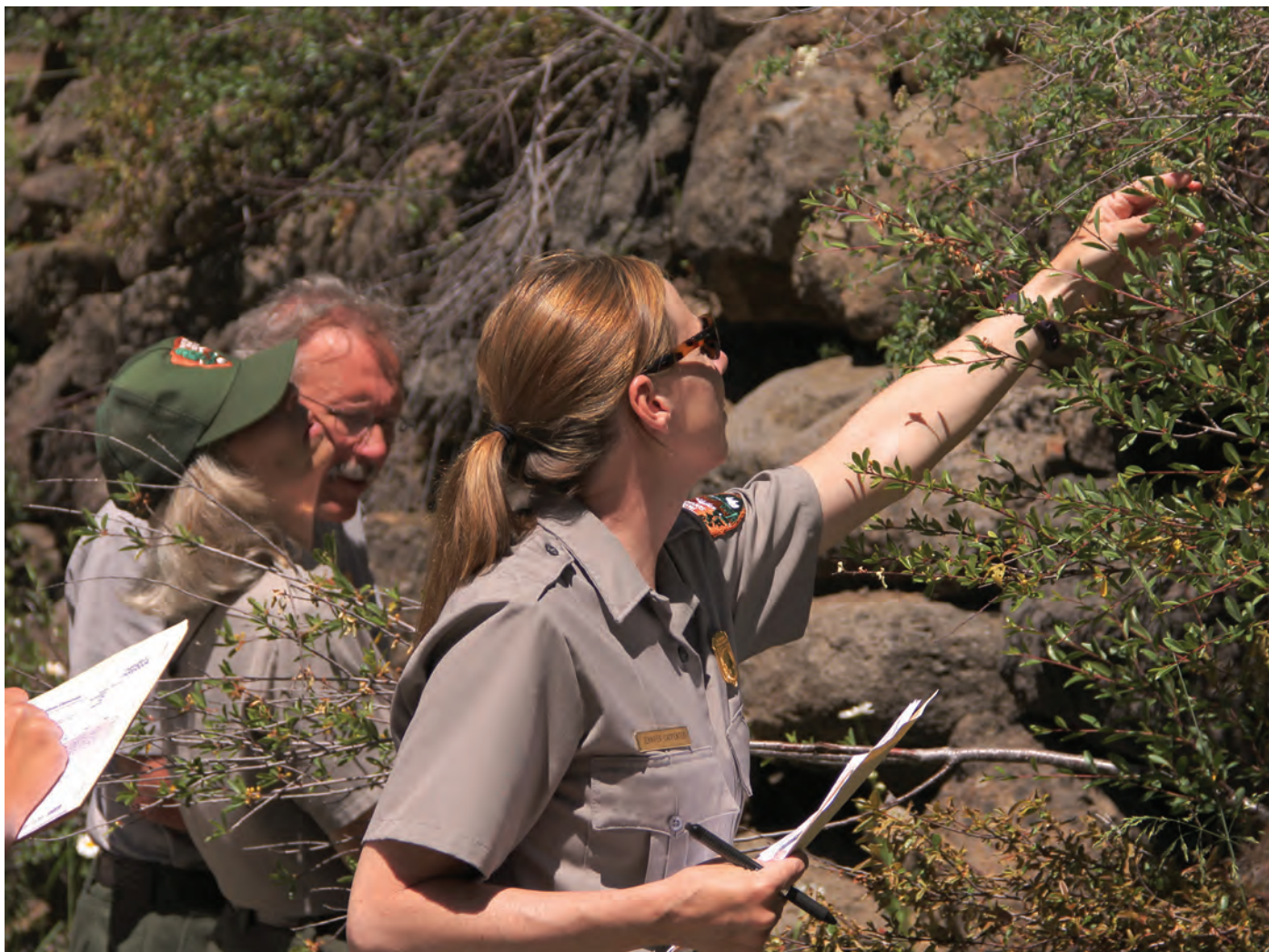
FIGURE 1. Park staff and volunteers learning how to monitor plant phenology at Lassen Volcanic National Park.

Our goals are to illustrate how national parks and their partners collaborate with USA-NPN to foster science and education in parks, and to invite and inspire