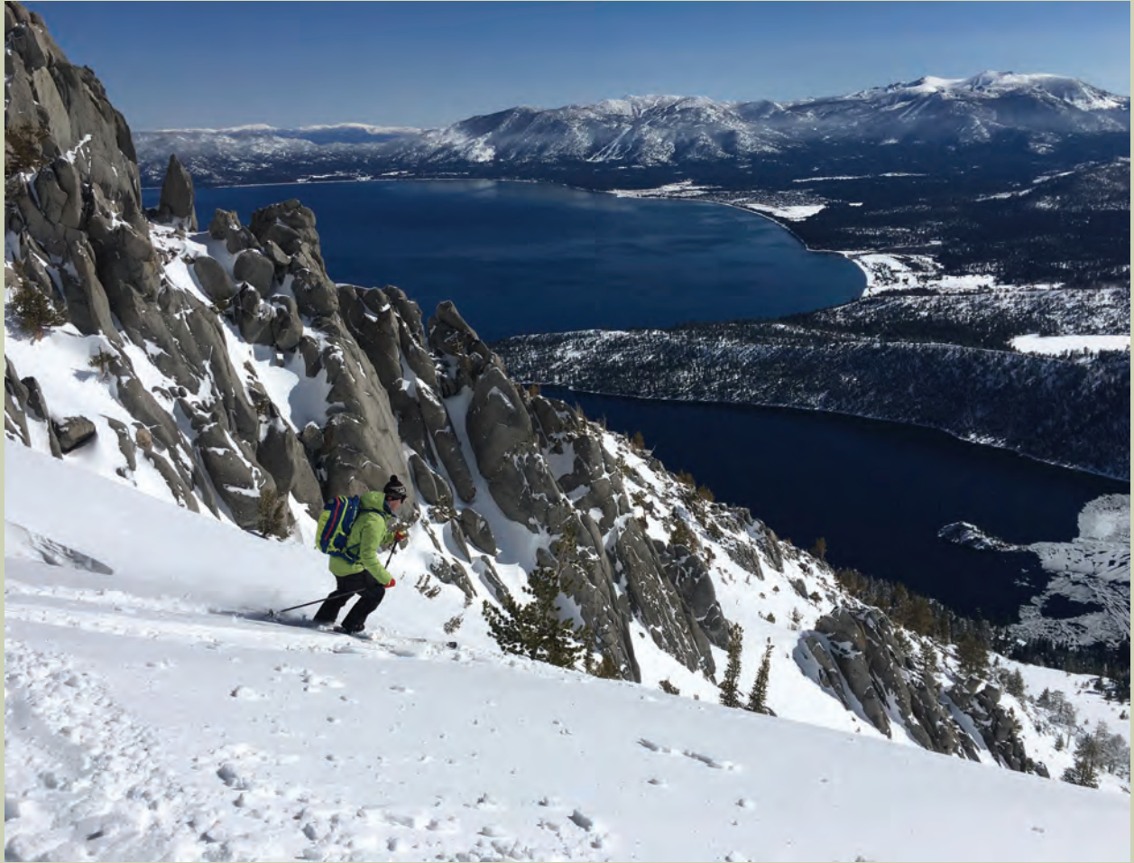
Enjoying the unique geodiversity of Lake Tahoe, California, USA.

Lake Tahoe is the largest alpine lake in North America, the second deepest, and is second only to the Great Lakes as the largest by volume in the United States. It is prized as a geoheritage wonder for the stunning clarity of its waters and the granodiorite mountains that rim the basin. The effects of climate change, however, are accelerating changes to the hydrology and aquatic and upland ecosystems, and are profoundly altering this national treasure. The Lake Tahoe Basin has annual visitation similar to that of a national park, but over 65,000 year-round residents also live within its borders. This combination makes it an intense testing ground for California's ability to adapt to climate change, as small communities and road networks are intimately woven throughout the basin's spectacular waters, mountains, and forests.