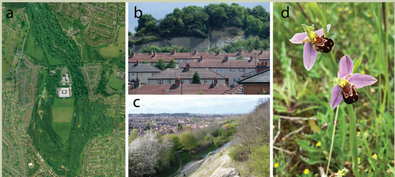
a. Aerial view of Wren's Nest NNR and surrounding housing estates. b. View looking eastwards from Wren's Nest housing estate to the prominent wooded hill of Wren's Nest NNR. c. View looking north westwards across Wren's Nest housing estate and the steeply dipping bedding plane exposures of the Silurian Upper Quarried Limestone. d. Bee orchid.

Geoconservation management at Wren's Nest includes maintaining a physically and visually accessible network of key exposures in the Silurian Limestone sequence. These exposures, including bedding plane