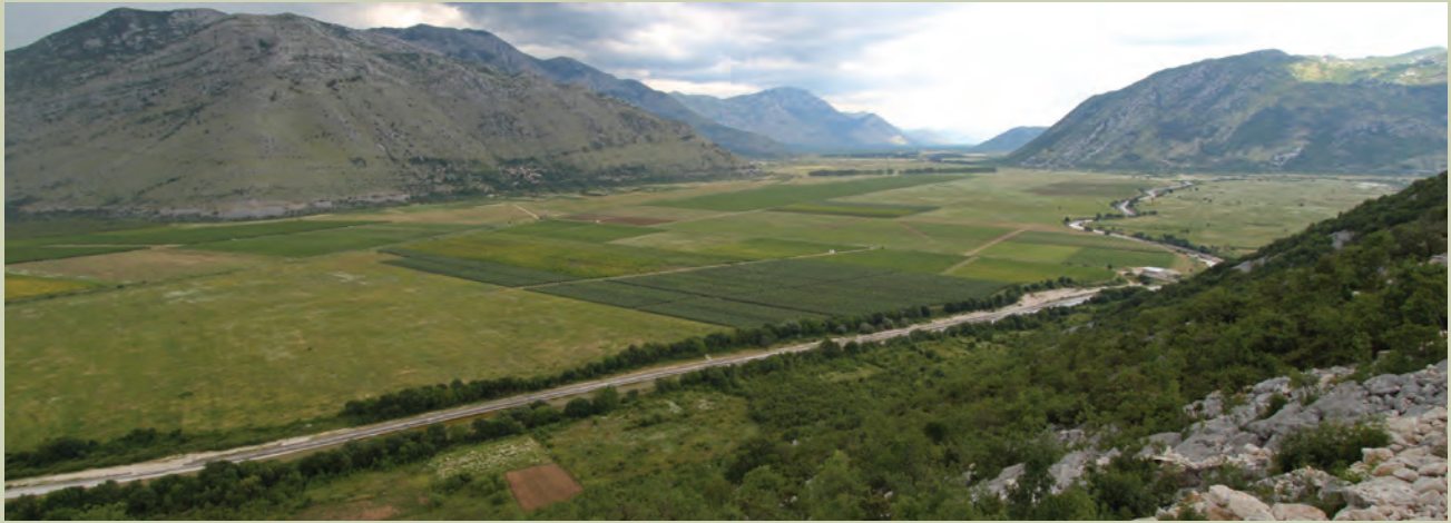
Popovo polje in Bosnia-Herzegovina is around 40km long and up to 5km wide. The Trebinjica River, now canalized, flows along its floor. Under natural conditions there were over 500 sinks ( ponors) and reversing springs ( estavelle).