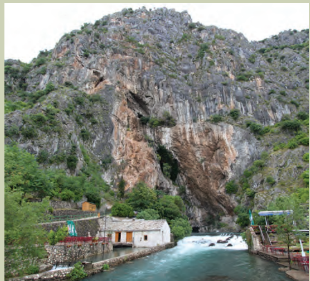
Buna Spring (Bosnia and Herzegovina) is one of the largest springs in Europe, with an annual average flow of about 43m 3 /s. It emerges at the head of a pocket valley.

coast and dissolution occurs at the interface of fresh and salt water. One feature that distinguishes caves from most other landforms is that as a new passage forms at lower levels in the carbonate rock sequence, the older, relict, passage remains at higher elevation. This passage is preserved until the land surface is lowered to intersect with the top of the cave. Because this may take millions of years, caves have the potential to be extremely long-lived landforms.