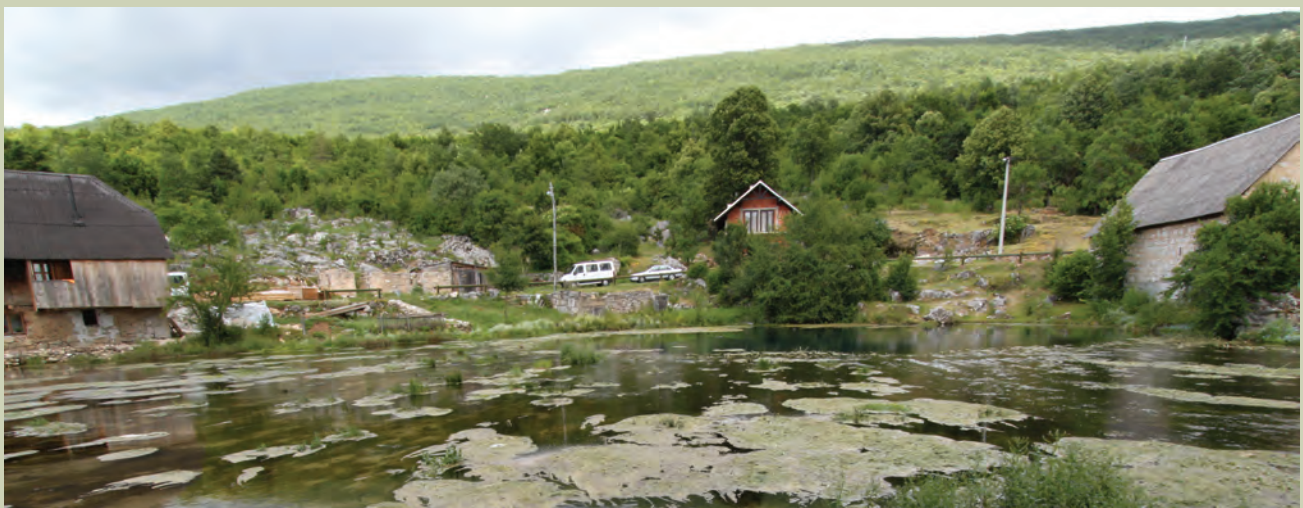
Majerovo Vrilo, Croatia: A large vauculian spring explored by cave divers to a depth of 92m below the point of emergence.