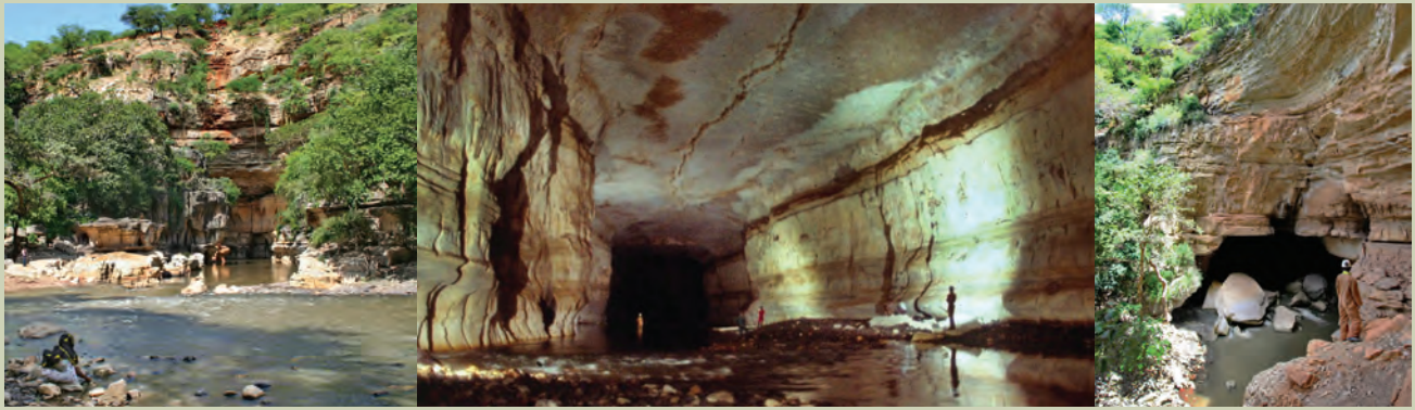
An example of a through cave in Ethiopia. Here, the Weib River sinks at the entrance to Sof Omar Cave (left) and can be followed through large passage (center) to the spring where it emerges (right).

are commonly extracted underground. Surface mines destroy karst landforms, but may also expose features of geoheritage value. Both surface and underground mines commonly intersect cave passages. The resolution calls on IUCN member states to conserve those mining environments that have high natural heritage value (both geological and biological).