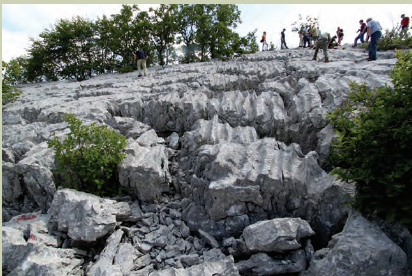
Karren in Montenegro.

In karst areas, streams commonly lose flow, with water sinking into the ground, either gradually over a reach of tens to hundreds of meters or at a single point, and emerging as springs that are sometimes many kilometers from the sink-point. Globally, there are many thousand karst springs, including all of the world's largest springs in terms of average and maximum discharge. The zone between sink and spring may extend beneath non-carbonate rocks that provide no evidence of the karst at depth. Where carbonates crop out, they are commonly devoid of surface drainage and a wide variety of surface landforms may be present depending on climate, lithology, and the presence or absence of superficial deposits. As carbonate rocks are commonly of high purity, the dissolution process yields little material on which soils can form. Consequently, these areas have rocky surfaces on which there are a variety of small solution pits, grooves, and channels, collectively known as karren . Where there is a thicker soil cover, most commonly developed on superficial deposits such as glacial till, loess, or volcanic ash, the surface is typically pitted by closed depressions ( dolines ; also known as sinkholes ) that range in diameter from 2–100m and in depth from 1–650m. Other typical