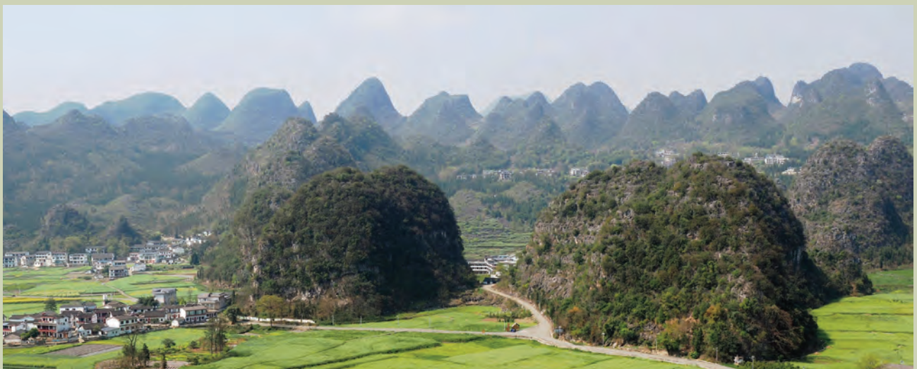
Wan Fenglin in Xingyi Geopark, Guizhou, China: an example of spectacular fenglin-type karst.

The fact that many protected areas, including those recognized by UNESCO, contain carbonate karst should mean that their karst geoheritage is acknowledged and protected. However, within these pro-