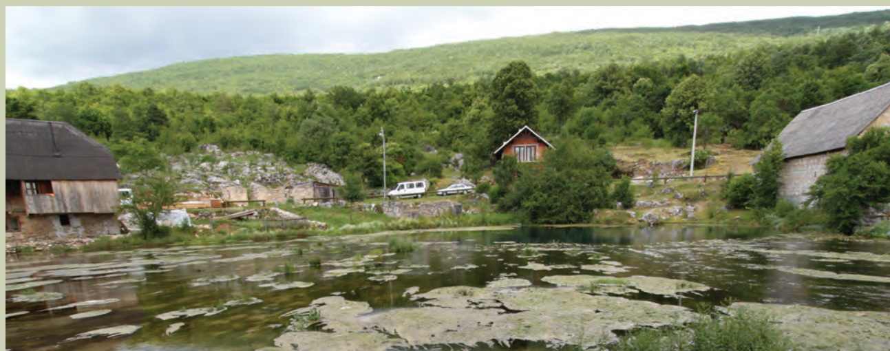
Majerovo Vriilo, Croatia: A large vaclusian spring explored by cave divers to a depth of 92m below the point of emergence.