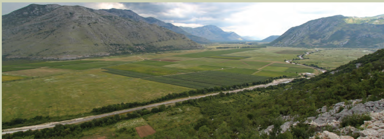
Popovo polje in Bosnia-Herzegovina is around 40km long and up to 5km wide. The Trebinjica River, now canalized, flows along its floor. Under natural conditions there were over 500 sinks ( ponors) and reversing springs ( estavelle).