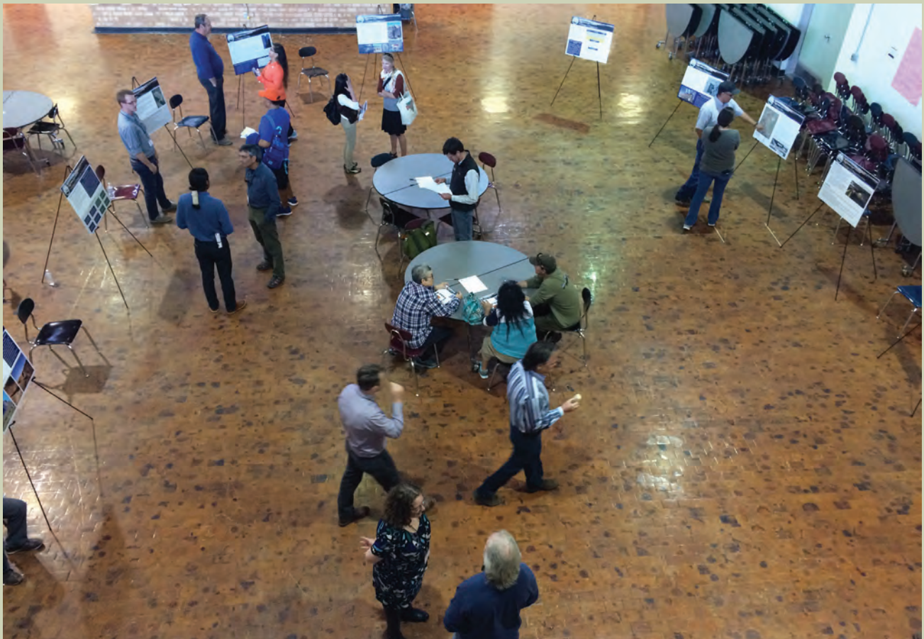
Public outreach in the Navajo Nation. © DANIEL TORMEY

There are many ways of communicating with people who are visiting protected areas or are looking at a distance, from traditional techniques to the most innovative social media platforms. And there are many different objectives of communication, such as education and knowledge transfer and provision