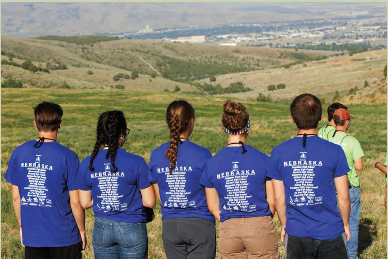
An Envirothon student team ready to engage in place-based learning.

which winning teams from participating US states and Canadian provinces compete for recognition and scholarships by demonstrating their knowledge of environmental science and natural resource management. The program has a strong outdoor component, and is sponsored by the US Forest Service, the US Natural Resources Conservation Service, and others. Much of the field education and field competitions are held in areas protected for their geoheritage and biodiversity values, and this use of geoheritage as a gateway to the broader educational goals is central to the program. The Envirothon's emphasis on both project-based and place-based learning make it a perfect fit for enhancing natural science education in China. By broadening the influence of the Envirothon program and its underlying conservation goals in China, this work provides a platform for project-based learning opportunities and field-based experiences as well as to foster international collaboration.