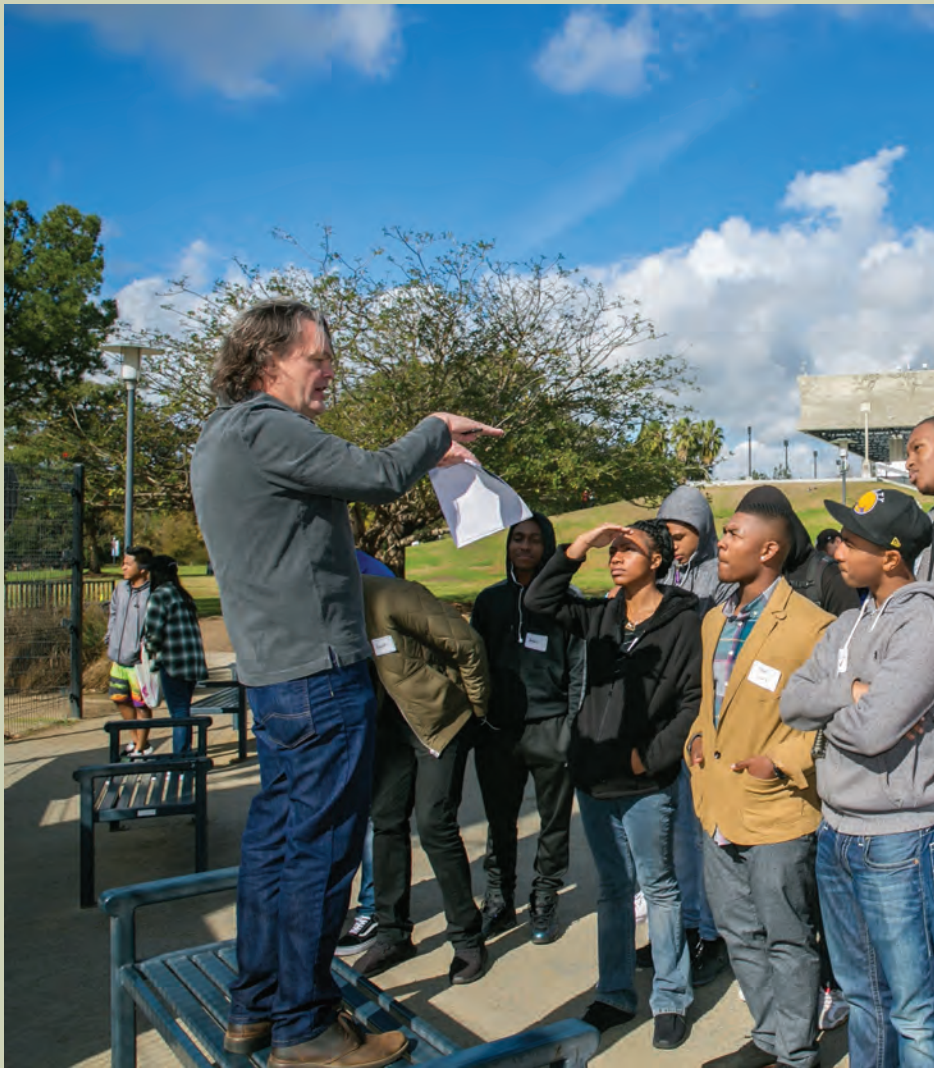
Time travel back to the last Ice Age at the La Brea Tar Pits in Los Angeles, California, USA.

Geoheritage supports a broader understanding of the environment and the stage upon which biodiversity, cultural practices, and climate change adaptation operate. Realizing these multiple benefits depends on building a conservation ethic through effectively communicating geoheritage: helping to interpret geoheritage to interested visitors; providing educational opportunities for those who want to go deeper in their understanding and appreciation; and moving to becoming apostles of a true environmental conservation ethic that includes participating in public outreach and engagement in protected area management. As Jacques Cousteau said: “In the final analysis, people protect only what they love.”