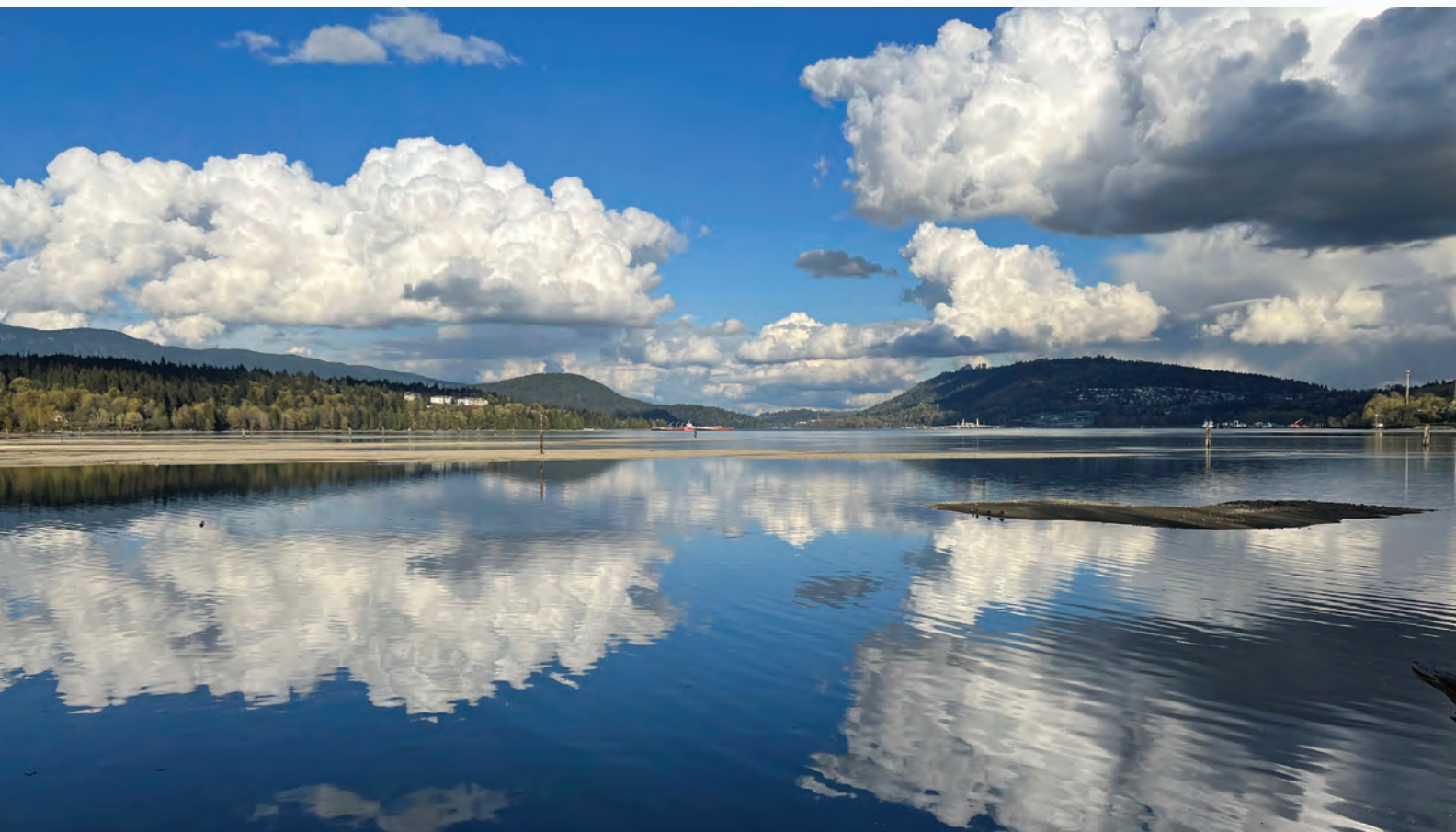
▼ Burrard Inlet