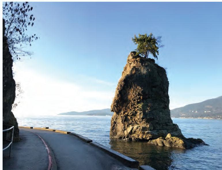
▼ Siwash Rock