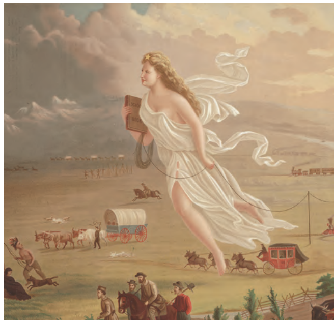
Detail from “American Progress,” a painting by John Gast (1872).

The first article, “Rethinking Boundaries in a Half Earth World,” is by Tony Hiss. He takes on the twin crises of biodiversity loss and climate change, the earth’s fragility, and the need to protect half the earth’s land and water for nature. He explores the American assumption that progress is achieved through dominance over people and land, and the United States’ coincidental introduction of national parks to the world. He awakens hope for our future by invoking the wonder of sentience, the “oneness” of beings together on this planet, and the straightforward realization that protecting half the earth is possible.