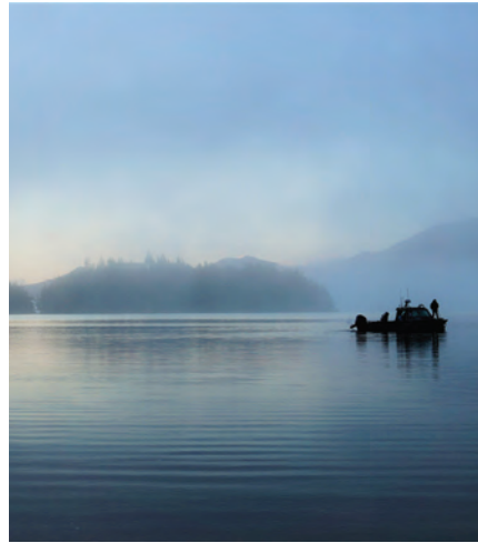
Boat in Gwaii Haanas.