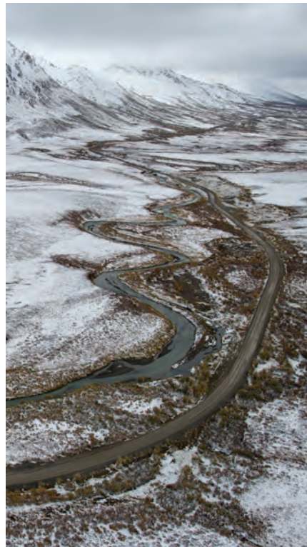
Dempster Highway bisecting Tombstone Territorial Park, Yukon (detail).