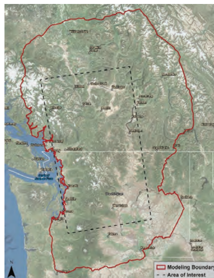
The Cascadia Region (outlined in red). CASCADIA PARTNER FORUM