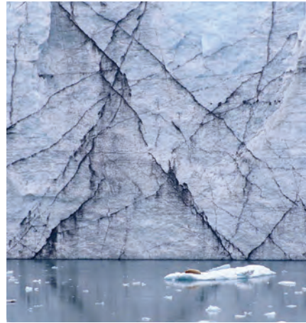
Detail from “The Wall.”