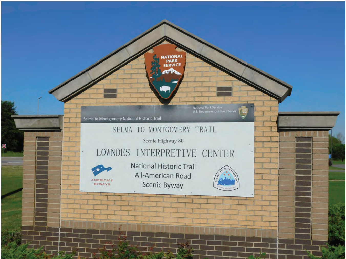
Lowndes Interpretive Center sign.