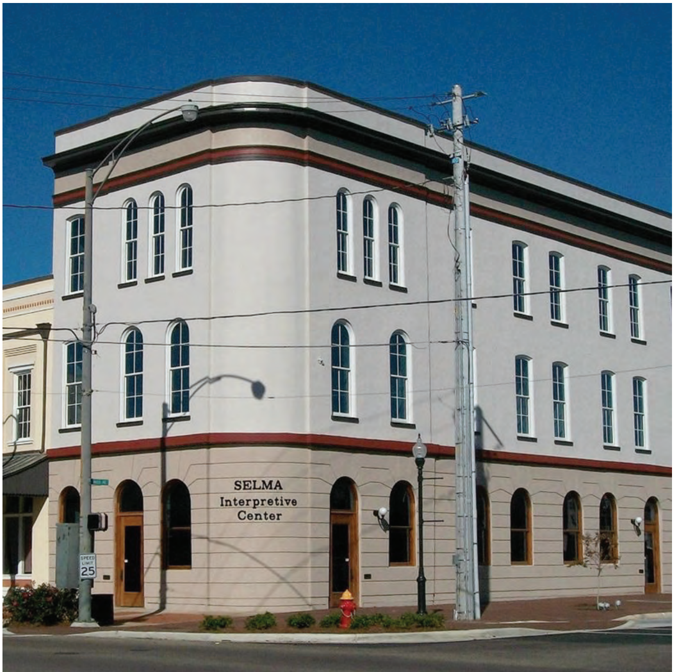
Selma Interpretive Center. NATIONAL PARK SERVICE

remodeled, with state-of-the-art exhibitions, a new theater and film, more visitor space new stations featuring local activists' stories, and a new interpretive focus on voting and citizenship, it will bring additional life to the trail.