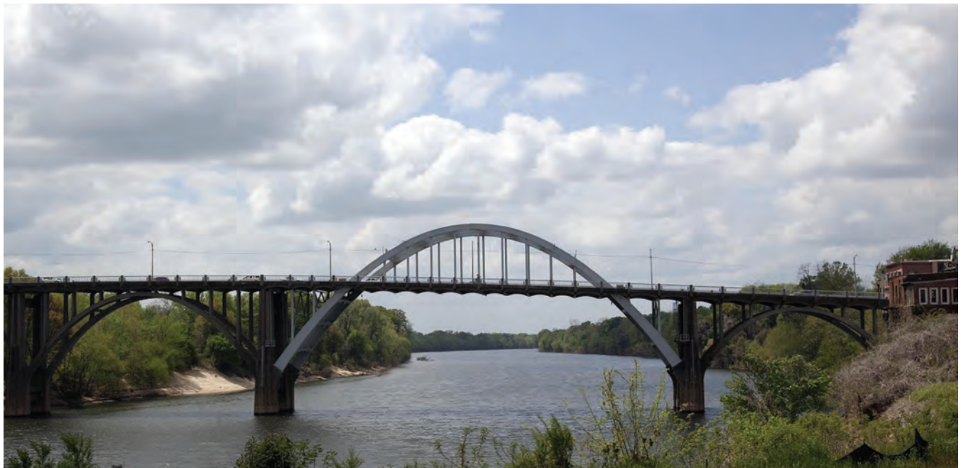
Edmund Pettus Bridge, Selma, Alabama, 2010.