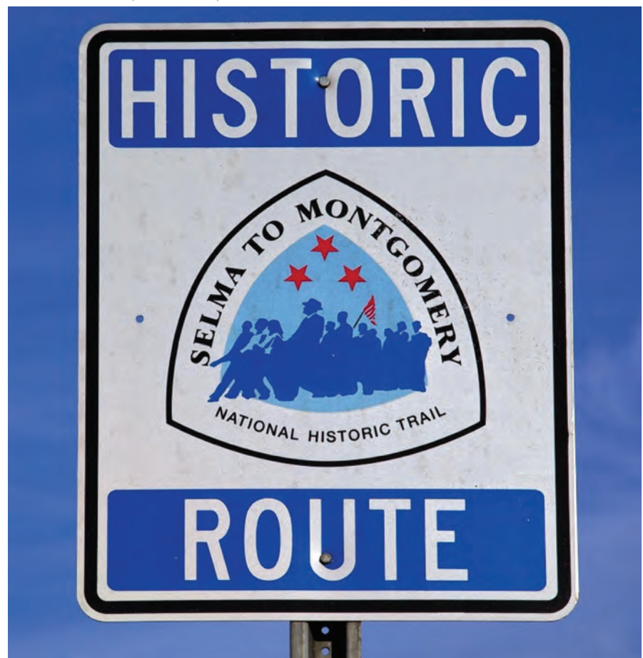
Official Selma to Montgomery National Historic Trail signage.

Congressional authorization of Selma to Montgomery National Historic Trail followed a decade of related efforts to commemorate the people, events, and places associated with the greater Civil Rights Movement, beginning with designation of the Martin Luther King, Jr., birthplace as a national historic site in 1980. 7 In 1989, Representative John Lewis, former member of SNCC and a leader of the 1965 march on the Edmund Pettus Bridge that became known as Bloody Sunday, introduced legislation in Congress to fund a Department of the Interior study to determine the eligibility and feasibility of a new historic trail that preserves the Selma-to-Montgomery March route under the National Trail Act of 1988. 8 Lewis saw the trail concept as a way of stringing together disparate places along the route, which covered three counties and two municipalities in Alabama's Black Belt region. Using historical research, oral history interviews,