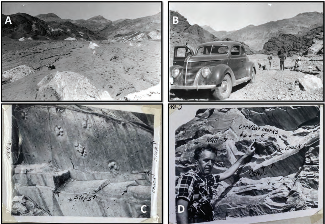
FIGURE 5. Historical photos showing concerns for protection of paleontological resources at Copper Canyon. (A–B) Vehicle traffic had once been allowed into Copper Canyon, which made the remote site much easier to access, but also resulted in the easy disappearance of fossils. (C–D) An example of a vandalism case that took place at Copper Canyon. 4C shows a felid trackway with seven prints. 4D shows where the felid track panel had been chiseled out.

From the 1940s to 2010s, several major research projects were undertaken to better identify the breadth of fossil resources and place them into a geological context. Four major projects (five including the present project) and several smaller ones have been carried out.