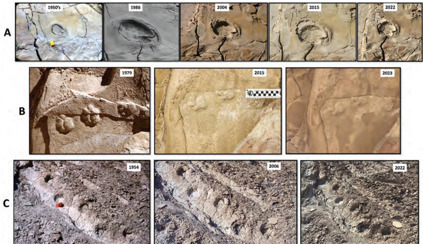
FIGURE 6. Historical to modern photographic comparisons of several important fossil localities at Copper Canyon. (A) A single camelid track, well preserved with infill cast taken in the photo taken in the 1950s, has conspicuously degraded over time from erosional factors. (B) A set of three felid tracks has fractured and now only one and a half are left in-situ. (C) A proboscidean trackway with five prints has experienced erosion on the exposed face, but also erosion of the slope weathering down toward the tracks.