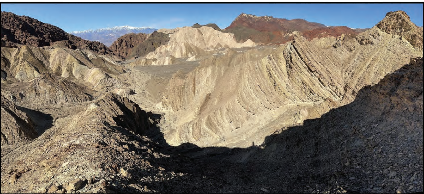
FIGURE 2. (A) Overview of Copper Canyon showing the general thickness of exposures of the track-bearing Copper Canyon Formation (light colored beds of finely laminated mudstones and siltstones). TORREY NYBORG

Death Valley National Monument was established on February 11, 1933, by presidential proclamation under the Antiquities Act of 1906; the monument was subsequently enlarged and its name changed to Death Valley National